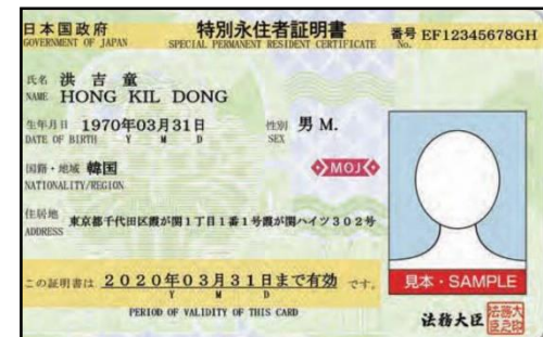
Special Resident Permanent Certificate