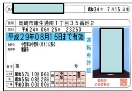
Japanese Driver's License Must have additional document See next page